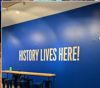
Program Outings The Atlanta History Museum • Broadway at the Fox Theatre